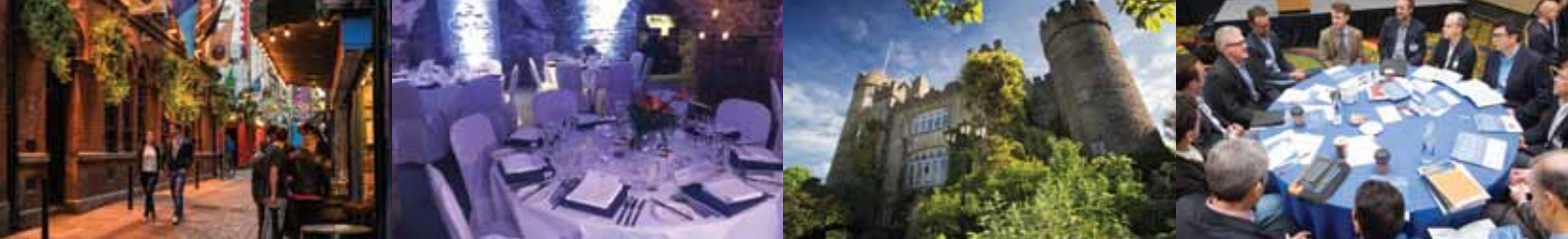
L-R: Temple Bar, Networking Diner at Christchurch Cathedral, Malahide Castle, Roundtable Briefing